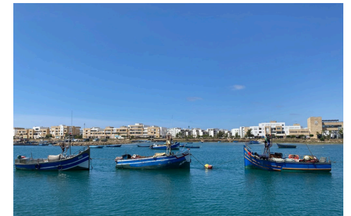
Rabat harbour, Morocco

During 2023 focus will be on finalizing the work done on the quality management system and on IT-security issues. Work will carry on within the components that were initiated during 2022, e.g. the statistical business register, administrative registers and water accounts. In addition activities will continue on setting up user groups to increase user involvement and to identify user needs. In the spring 2023 the plan is to produce some video material on the results in the project up to now and on the statistical business register in particular ■