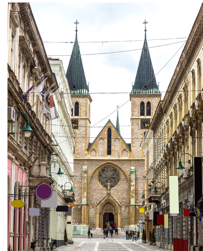
Sarajevo, Bosnia and Herzegovina

The project will end during 2023 but it is already confirmed that the work will be continued in a 5th Twinning project. This and the new project will be run back to back. Efforts on business statistics and Balance of Payments will continue. ICT and Tourism will be included as new subjects ■