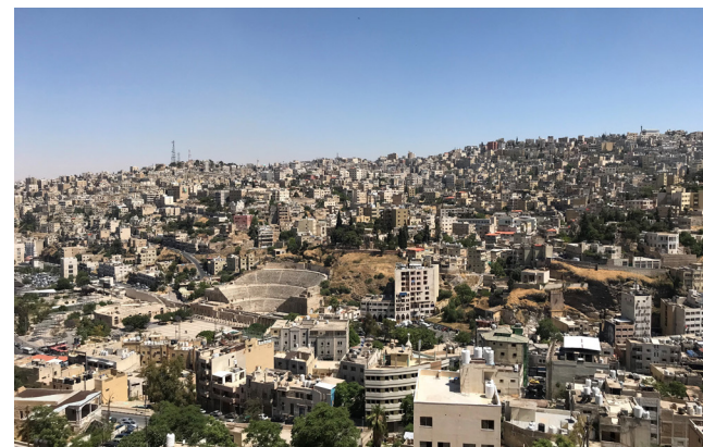
The Roman Theatre seen from the Citadel in downtown Amman

The Twinning project will in 2023 follow the initial work plan approved in late 2022. The achievements of benchmarks and indicators will be followed up closely, and actions will be taken by the project management to ensure implementation of relevant and sustainable solutions for DoS ■