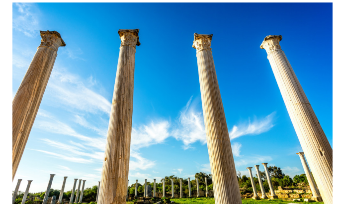
Ancient columns at Salmis, Greek and Roman archaeological site, Famagusta, North Cyprus

To improve statistical actions regarding administrative data sources management and governance, and further develop statistics in the Turkish Cypriot Community.