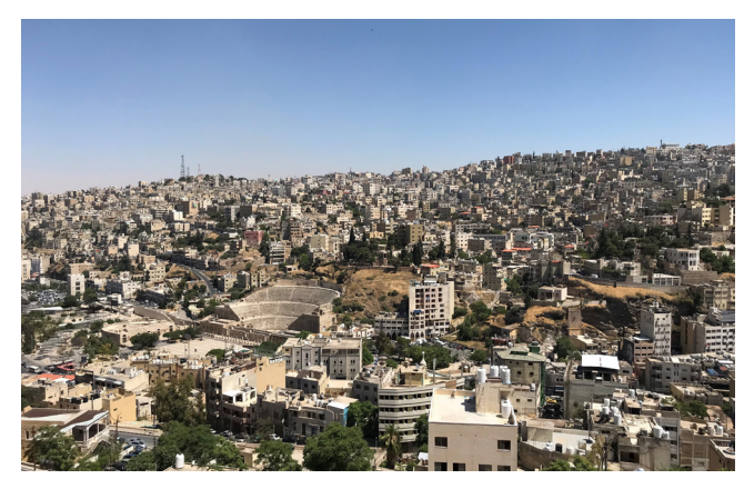
The Roman Theatre seen from the Citadel in downtown Amman

The Twinning project will in 2023 follow the initial work plan approved in late 2022. The achievements of benchmarks and indicators will be followed up closely, and actions will be taken by the project management to ensure implementation of relevant and sustainable solutions for DoS