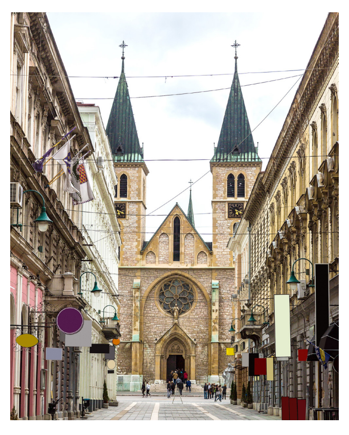
Sarajevo, Bosnia and Herzegovina

The project is the fourth Twining project between Statistics Denmark (SD) and the partners of National Statistical System (NSS) of Bosnia and Herzegovina. The overall objective is to modernise the NSS and align its products to European standards, thereby underpinning the country's status as an EU candidate country.