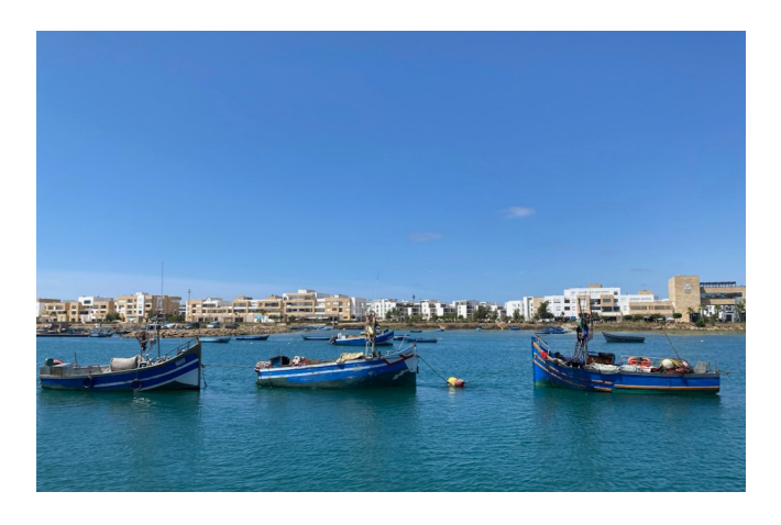
Rabat harbour, Morocco

During 2023 focus will be on finalizing the work done on the quality management system and on IT-security issues. Work will carry on within the components that were initiated during 2022, e.g. the statistical business register, administrative registers and water accounts. In addition activities will continue on setting up user groups to increase user involvement and to identify user needs. In the spring 2023 the plan is to produce some video material on the results in the project up to now and on the statistical business register in particular