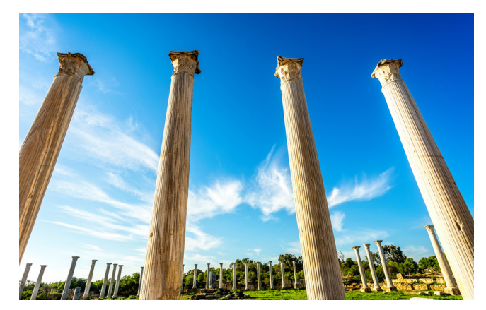
Ancient columns at Salamis, Greek and Roman archaeological site, Famagusta, North Cyprus

To improve statistical actions regarding administrative data sources management and governance, and further develop statistics in the Turkish Cypriot Community.