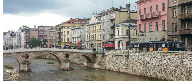
Touring Bosnia & Herzegovina on one of many missions.