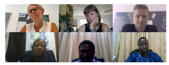
Virtual engagement regarding the drafting of a Data Quality Assurance Framework.

The strategic sector cooperation between Ghana Statistical Service (GSS), Statistics Denmark (SD) and the Ministry of Foreign Affairs (MFA) lays down the foundation for a statistical system that should ultimately be based on fewer surveys, while at the same time ensuring more data and higher data quality. This is to strengthen the foundation for evidence-based decision making in Ghana and improving monitoring and reporting of the UN SDGs.