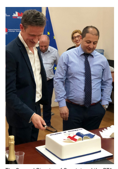
The General Director of Geostat and the RTA opened the Twinning project two years ago with cake and champagne.

project is pleased to assist on those issues as well, and look forward to continue with the training sessions in "R" software, assist in finalising the development of a Harmonized Index of Consumer Prices, read the Geostat IT strategy built upon the IT-sector review in which the Twinning project participated, and to assess the possibilities of developing Georgian Satellite Sports Accounts