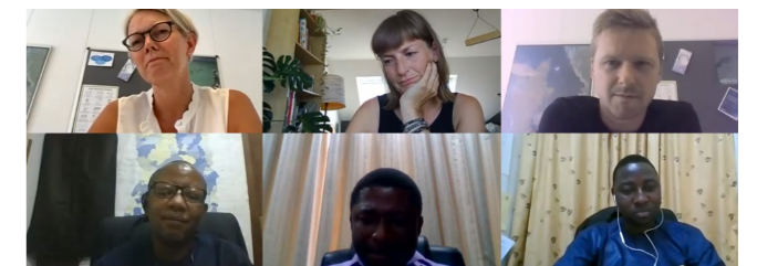
Virtual engagement regarding the drafting of a Data Quality Assurance Framework.

The strategic sector cooperation between Ghana Statistical Service (GSS), Statistics Denmark (SD) and the Ministry of Foreign Affairs (MFA) lays down the foundation for a statistical system that should ultimately be based on fewer surveys, while at the same time ensuring more data and higher data quality. This is to strengthen the foundation for evidence-based decision making in Ghana and improving monitoring and reporting of the UN SDGs.