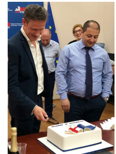
The General Director of Geostat and the RTA opened the Twinning project two years ago with cake and champagne.

project is pleased to assist on those issues as well, and look forward to continue with the training sessions in "R" software, assist in finalising the development of a Harmonized Index of Consumer Prices, read the Geostat IT strategy built upon the IT-sector review in which the Twinning project participated, and to assess the possibilities of developing Georgian Satellite Sports Accounts ■