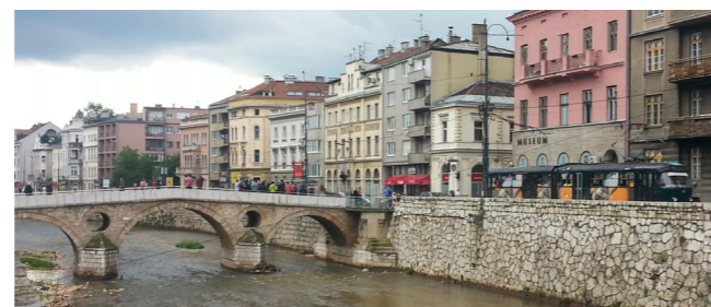
Touring Bosnia & Herzegovina on one of many missions.